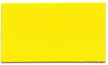
DM3159 YELLOW LIGHT