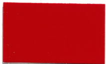
DM3147 RED DARK