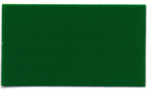
DM3154 GREEN DARK