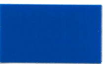
DM3196 BLUE MED