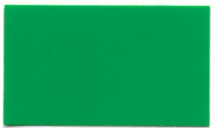
DM3167 GREEN MED