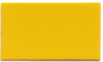
DM3148 YELLOW MED