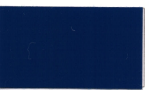
Dm3183 BLUE DARK